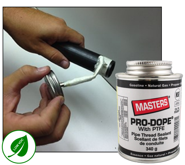
NOT FOR USE ON Oxygen or Glycol Systems. We recommend MASTERS® ORANGE T-TAPE.