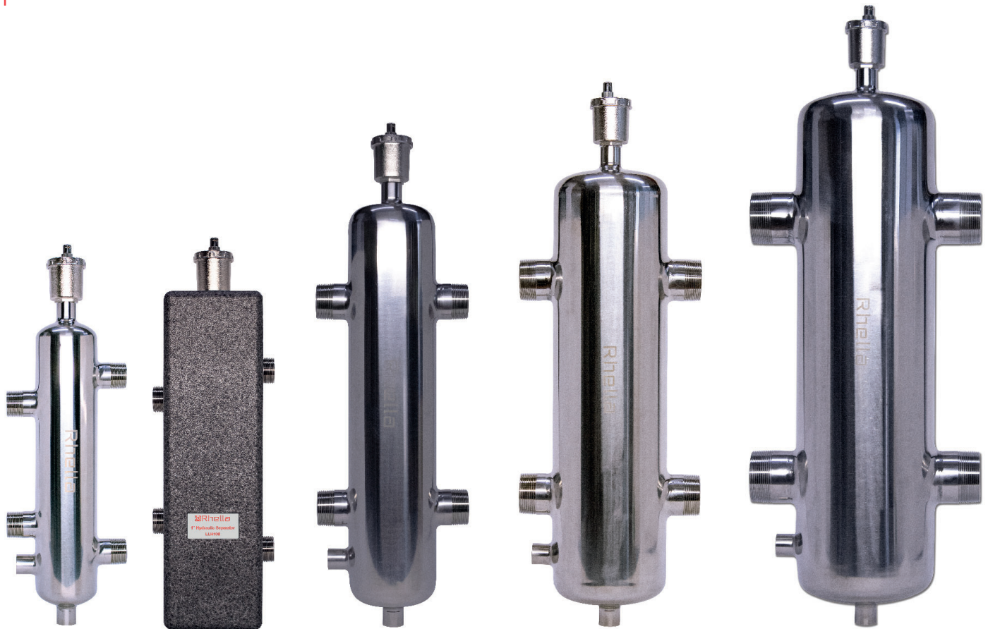
LLH100 - With Insulation