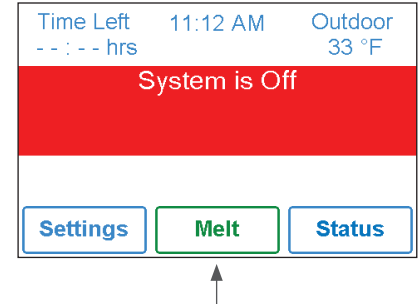
Press Melt button to start melting operation